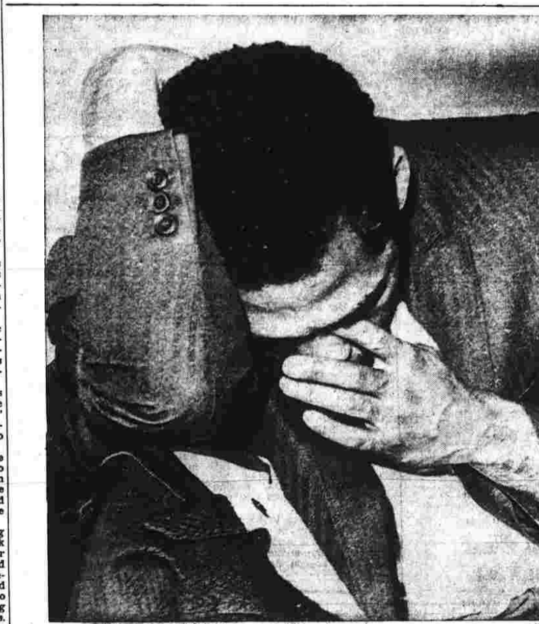
Champion Weeps at News of Moore's Death. Boxer Sugar Ramos, 31, who knocked out featherweight champion Davey Moore last Thursday, weeps after hearing of Moore's death in Los Angeles today.