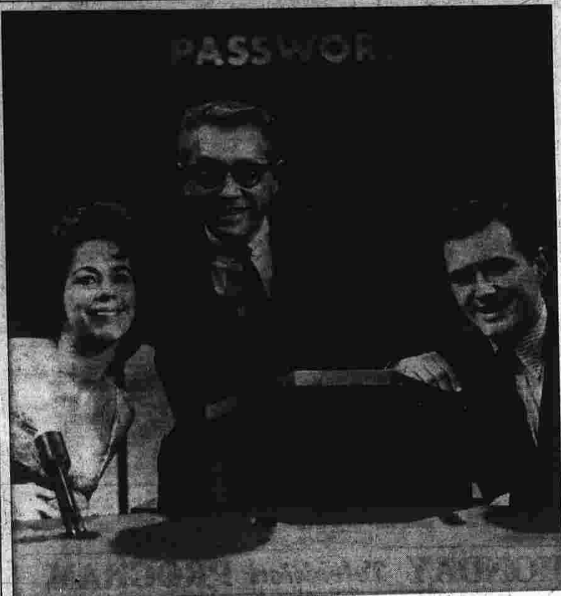
Allen Ludden and 'Password' opponents Carol Burnett and Orson Bean.

Then, the contract was not renewed. "Same thing as being